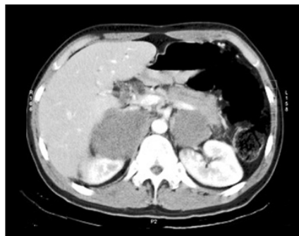
Figure 1. Computed tomography images of the abdomen revealed a hypo dense mass in the right sub diaphragmatic area , superior to the right kidney which was suggestive of an" adrenal tumor " with adjacent hepatic involvement.

These characteristics were indicative of an adrenal gland tumor with adjacent liver involvement (Figure 1). Moreover, a smaller lesion with similar specifications was observed in the left adrenal gland. The evaluation of the bone marrow biopsy and aspiration detected no bone marrow metastasis. Upper gastrointestinal endoscopy demonstrated erosive gastritis and the duodenum was normal. To obtain a diagnosis and possibly treat the patient, needle biopsy was performed from