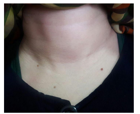
Figure 2. After one month, thyroid was painless but the warmth and redness continued with less intensity

After consultation with an endocrinologist, Prednisolone (50 mg/day) was started and the venlafaxine dose was initially reduced to 75 mg/ day and then to 37.5 mg/day. As an alternative to venlafaxine, sertraline (25 mg/day) was administrated and gradually elevated to the dose of 100 mg/day. After one month, thyroid was painless but the warmth and redness continued with less intensity (Figure 2). Venlafaxine administration was completely ceased, while continuing the treatments with sertraline (100 mg/day), propranolol (10 mg/day) and prednisolone (50 mg/ day). After discontinuation of venlafaxine, the thyroiditis symptoms completely resolved and the blood tests demonstrated hypothyroidism.