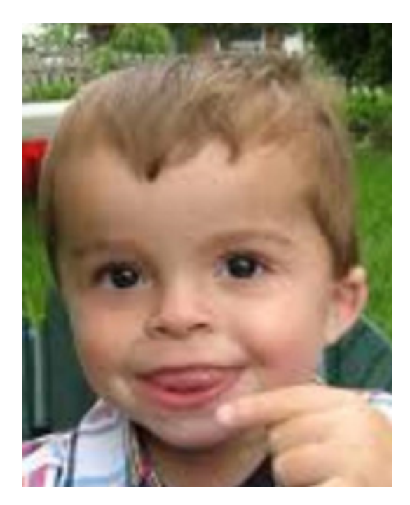
Figure 1. A sample patient with Kleefstra syndrome

ment with a generalized tonic-colonic seizure. He was under treatment by carbamazepine. In his medical history, he had a hospitalization in the neonatal intensive care unit (NICU) for five days due to tachypnea, low APGAR score, and meconium aspiration syndrome. There was however no hydrocephaly or other pathologic exams in his neonatal examination reports. He had had no problem until five months after birth, but he had recurrent upper respiratory infections during his infancy. At the age of 5.5 months, his parents noticed his neurodevelopmental delay. A sample patient with Kleefstra syndrome is presented in Figure 1.