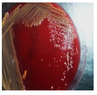
Figures 1. Shows E.meningoseptica yellowish nonhemolytic colonies on blood agar.

oproducts Ltd, UK) with 12 substrates was used to determine the biochemical reactions of the detected gram-negative rod. The other observed properties were as follows: catalase-positive, oxidase-positive, non-motile, catalase, indole- and oxidase-positive, and negative for mannitol, urease, citrate, and nitrate reduction. Therefore, the organism was identified as E. meningoseptica by the Microgen® ID system.