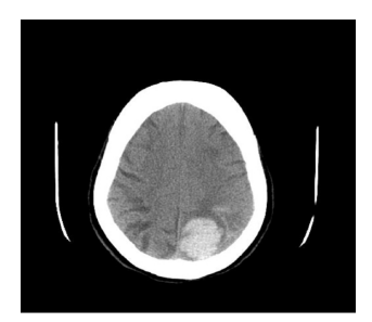
Figure 2. Non-Enhanced Brain CT-Scan Showing Intracranial Hemorrhage in Left Parietal Lobe

According to our observations, C3, C4, cANCA, pANCA, protein C, protein S, antithrombin III, blood urea nitrogen, creatinine, and liver function test were in the normal range. Immunoglobulin electrophoresis showed a normal value as well. In the brain CT-scan and MRI, a massive intraparenchymal brain hemorrhage was detected in the left parietal lobe (Figures 2 & 3).